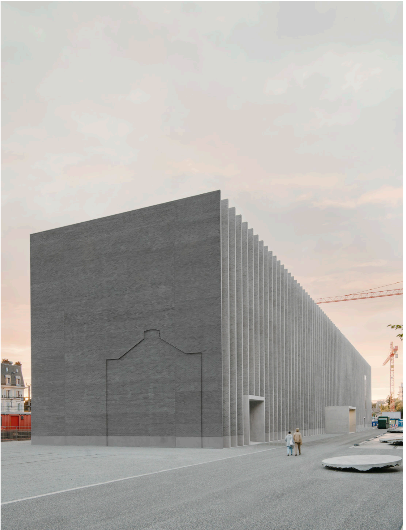
MUSÉE CANTONAL DES BEAUX-ARTS LAUSANNE, SWITZERLAND 2011-2019