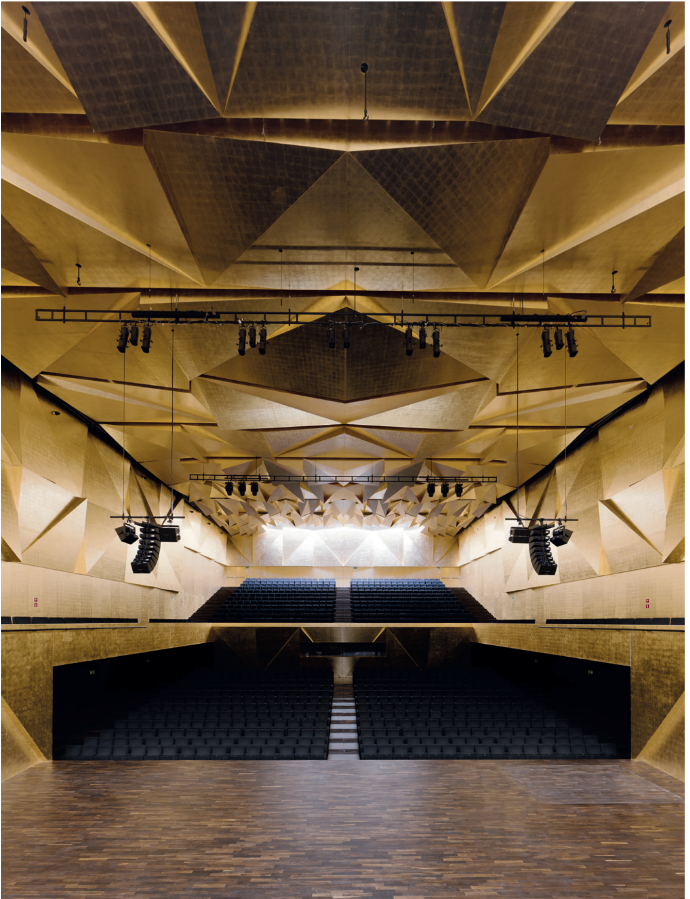
SZCZECIN PHILHARMONIC HALL, POLAND 2007-2014