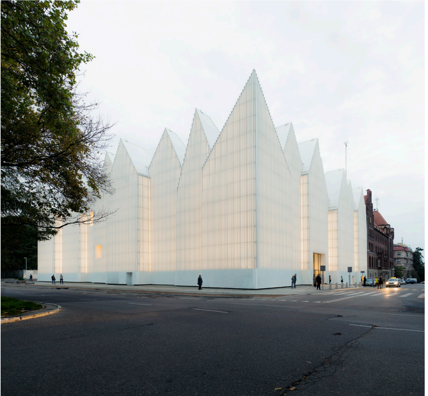
SZCZECIN PHILHARMONIC HALL, POLAND 2007-2014