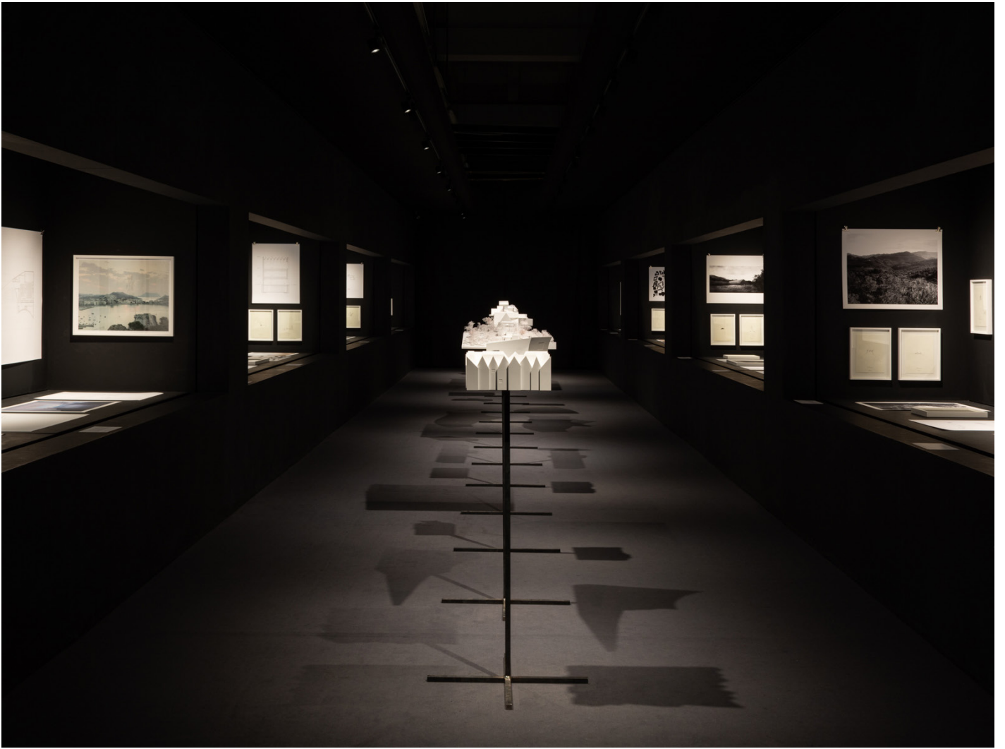
On Continuity, Venice, Italy 2021