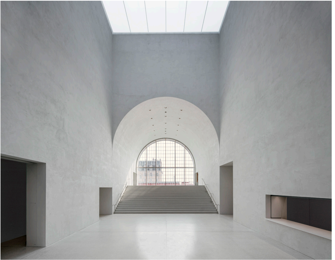
Musée cantonal des Beaux-Arts Lausanne, Switzerland 2011-2019