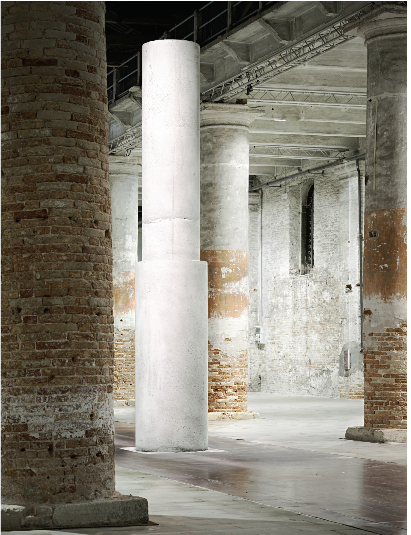
Sentimental Monumentality, Biennale di Venezia, Italy 2016