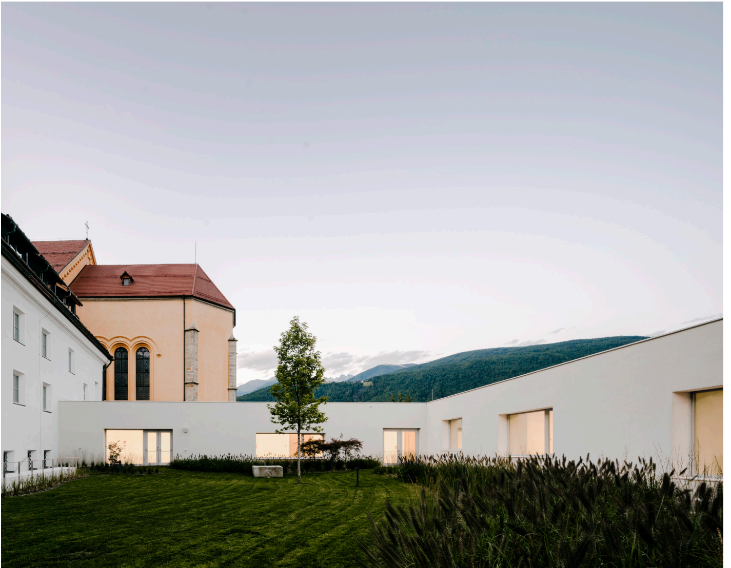
Ragenhaus Musikschule, Bruneck, Italy 2012–2018