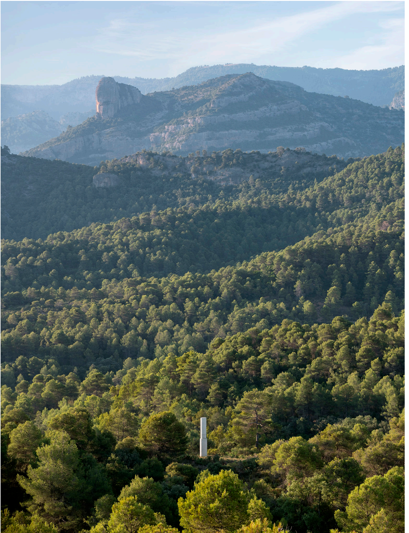
Sentimental Monumentality, Spain 2019