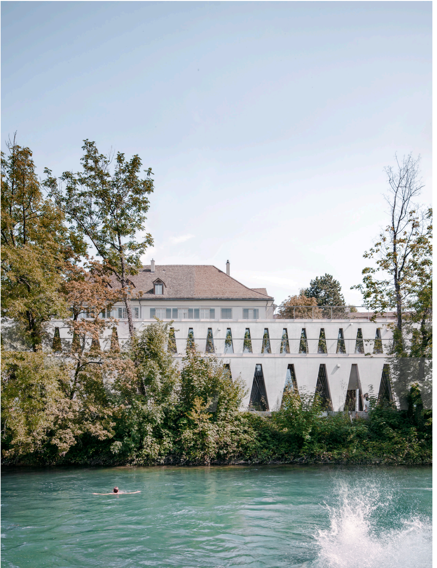
Tanzhaus Zürich, Switzerland 2014–2019