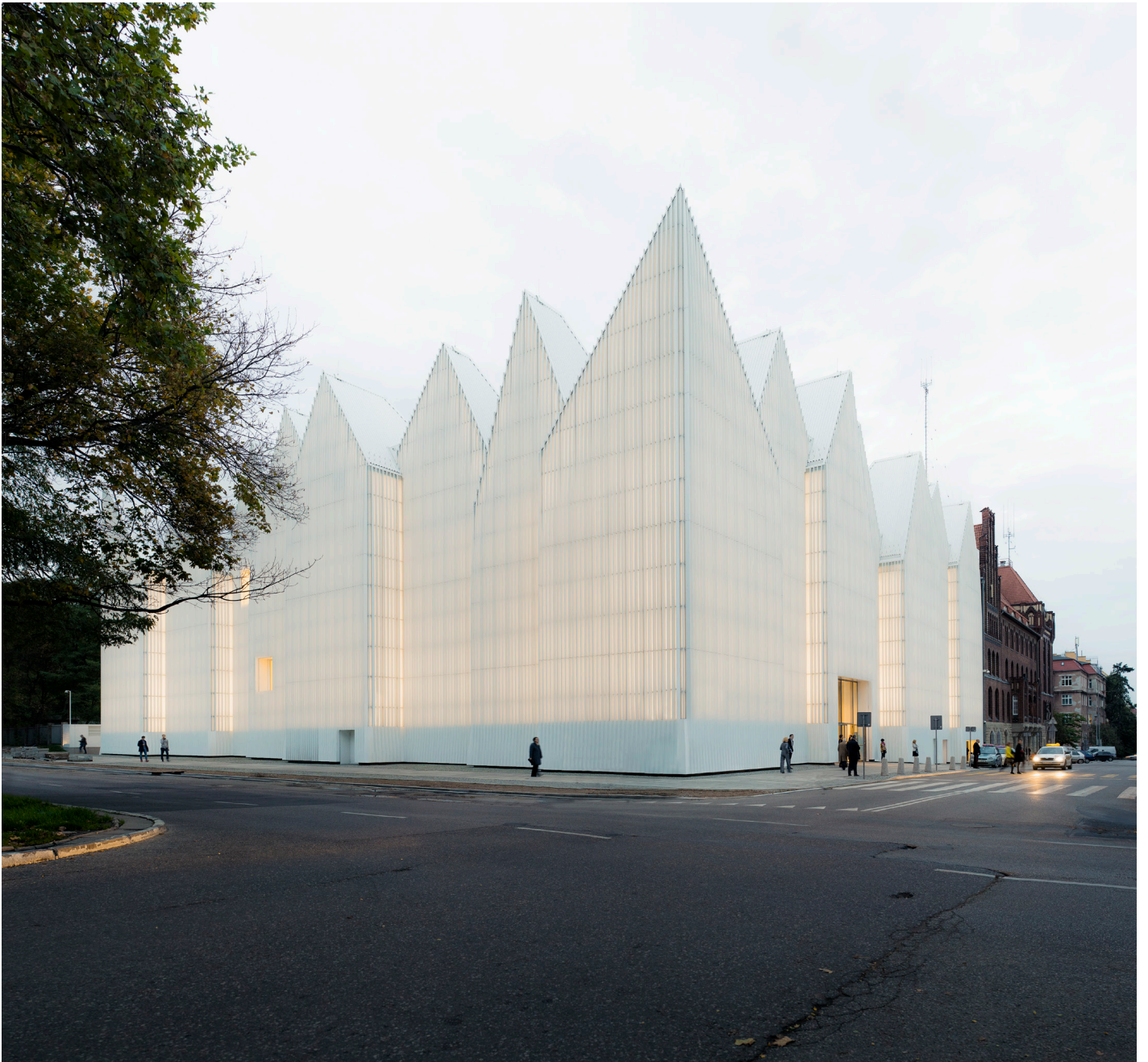
Szczecin Philharmonic Hall, Poland 2007-2014