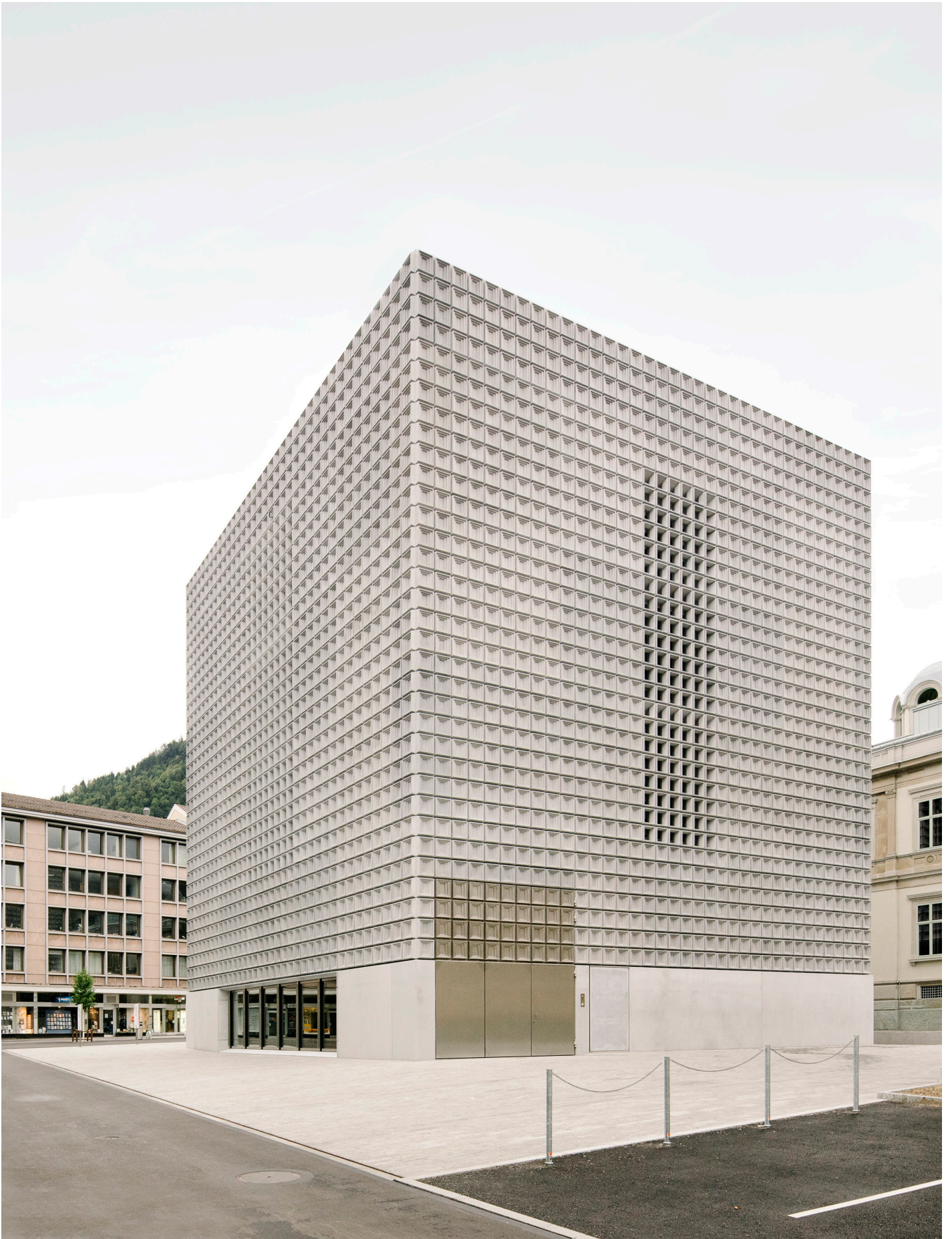
Bündner Kunstmuseum Chur, Switzerland 2012–2016