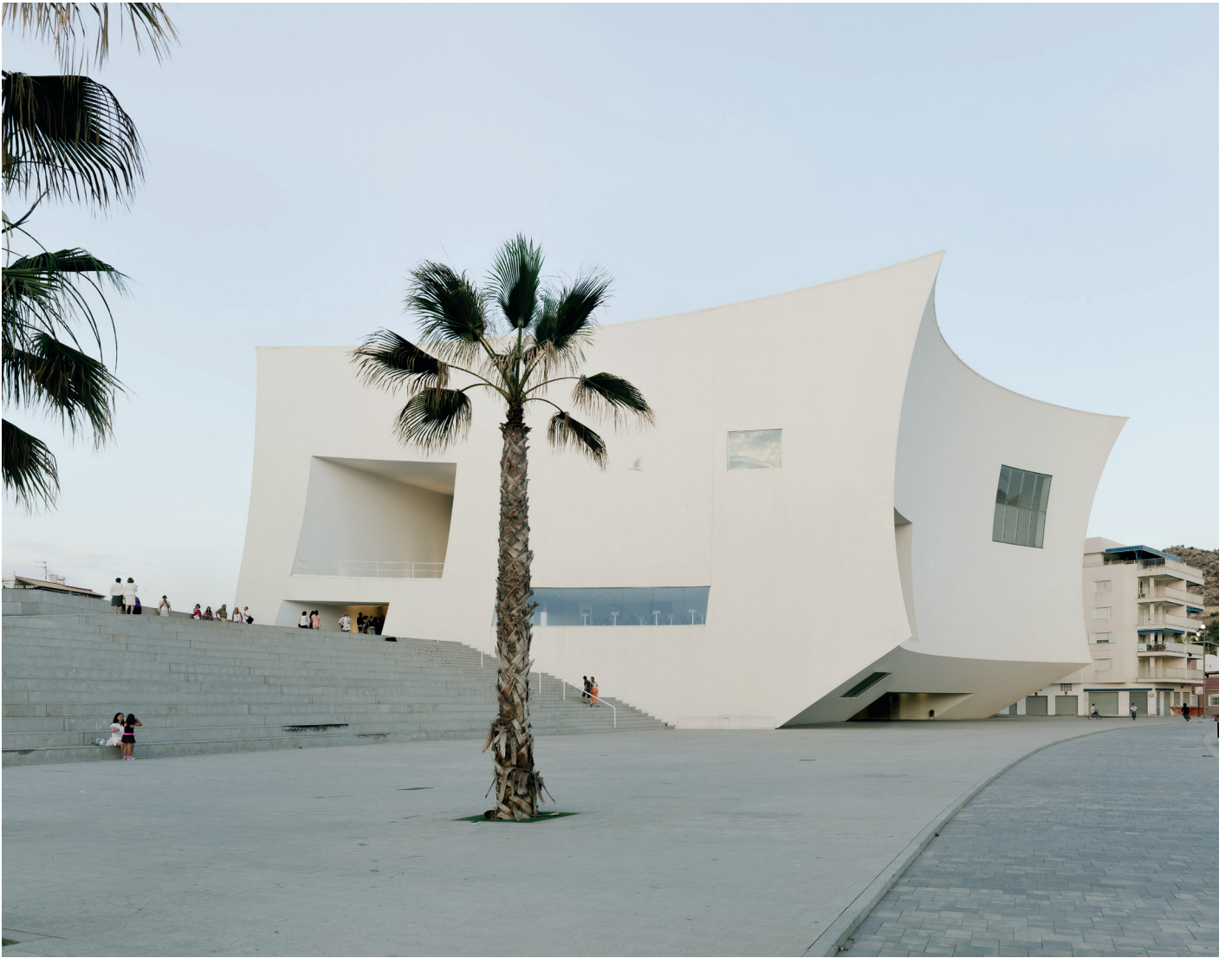
Águilas Auditorio Infanta Elena, Spain 2004–2011