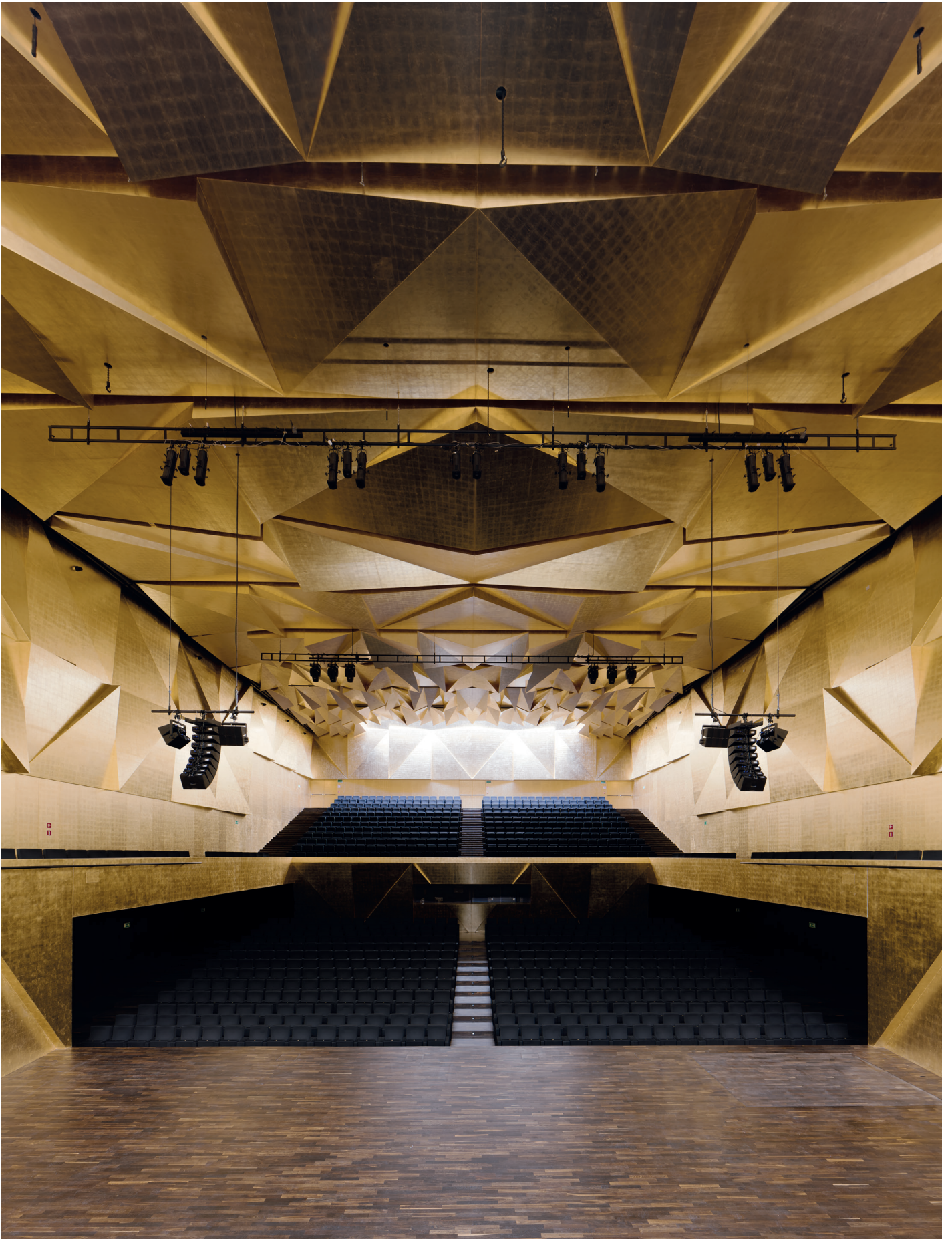
Szczecin Philharmonic Hall, Poland 2007–2014