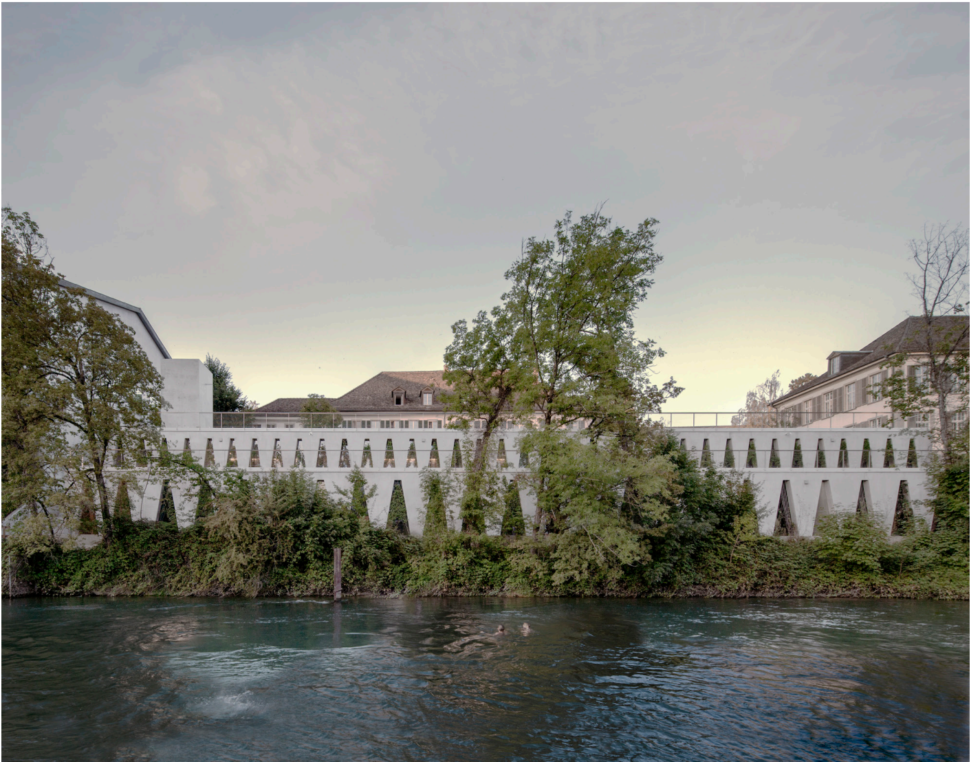
Tanzhaus Zürich, Switzerland 2014–2019