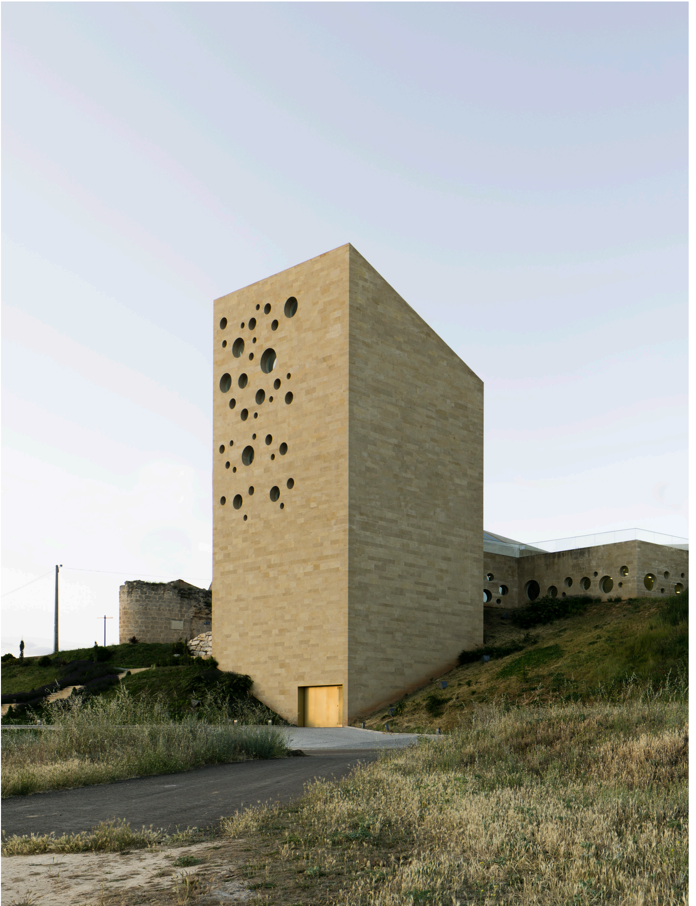
Ribera del Duero, Spain 2006–2011