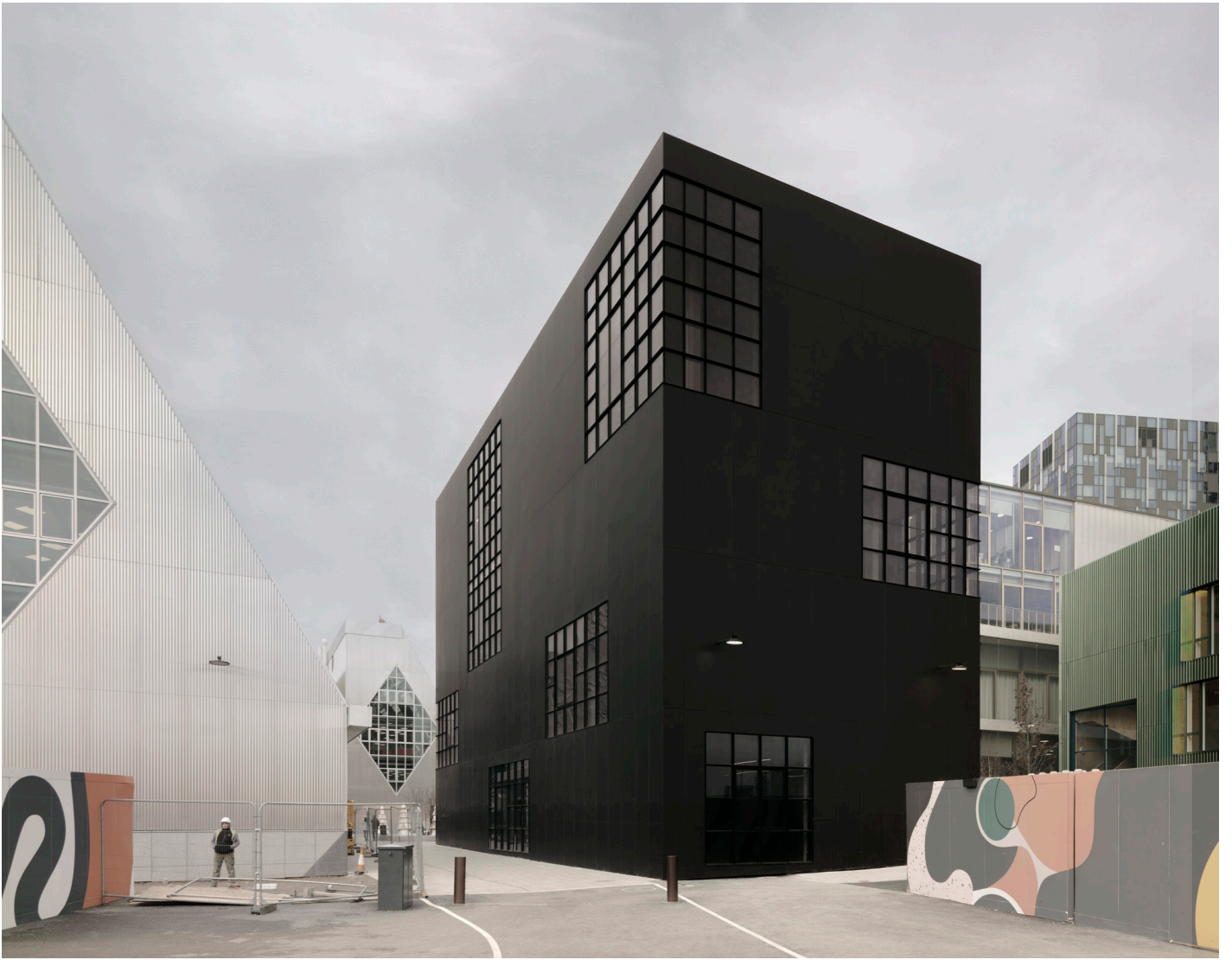
Artists' Atelier, London, United Kingdom, 2016–2021