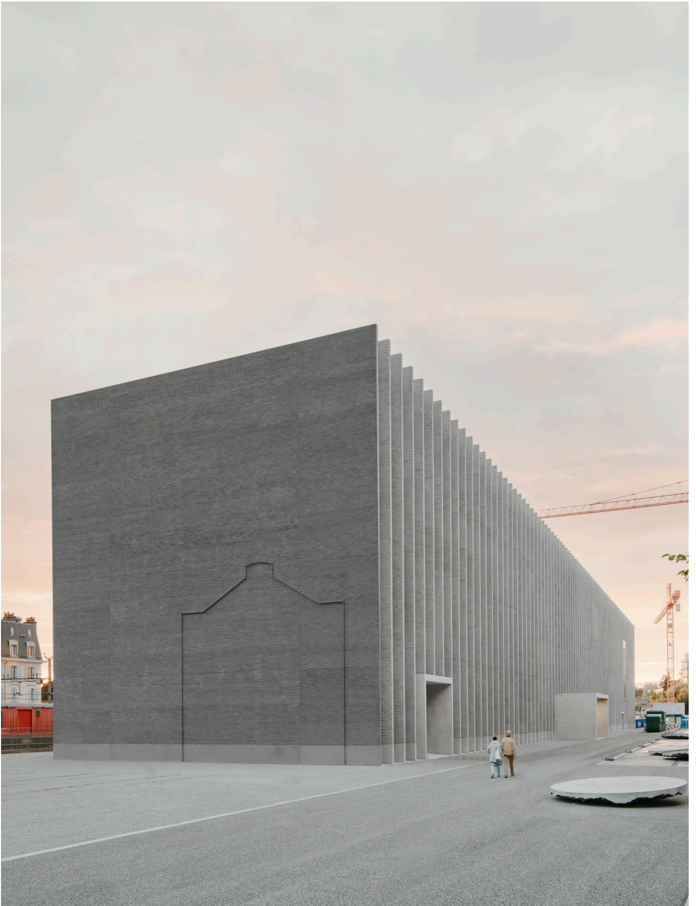
Musée cantonal des Beaux-Arts Lausanne, Switzerland 2011-2019