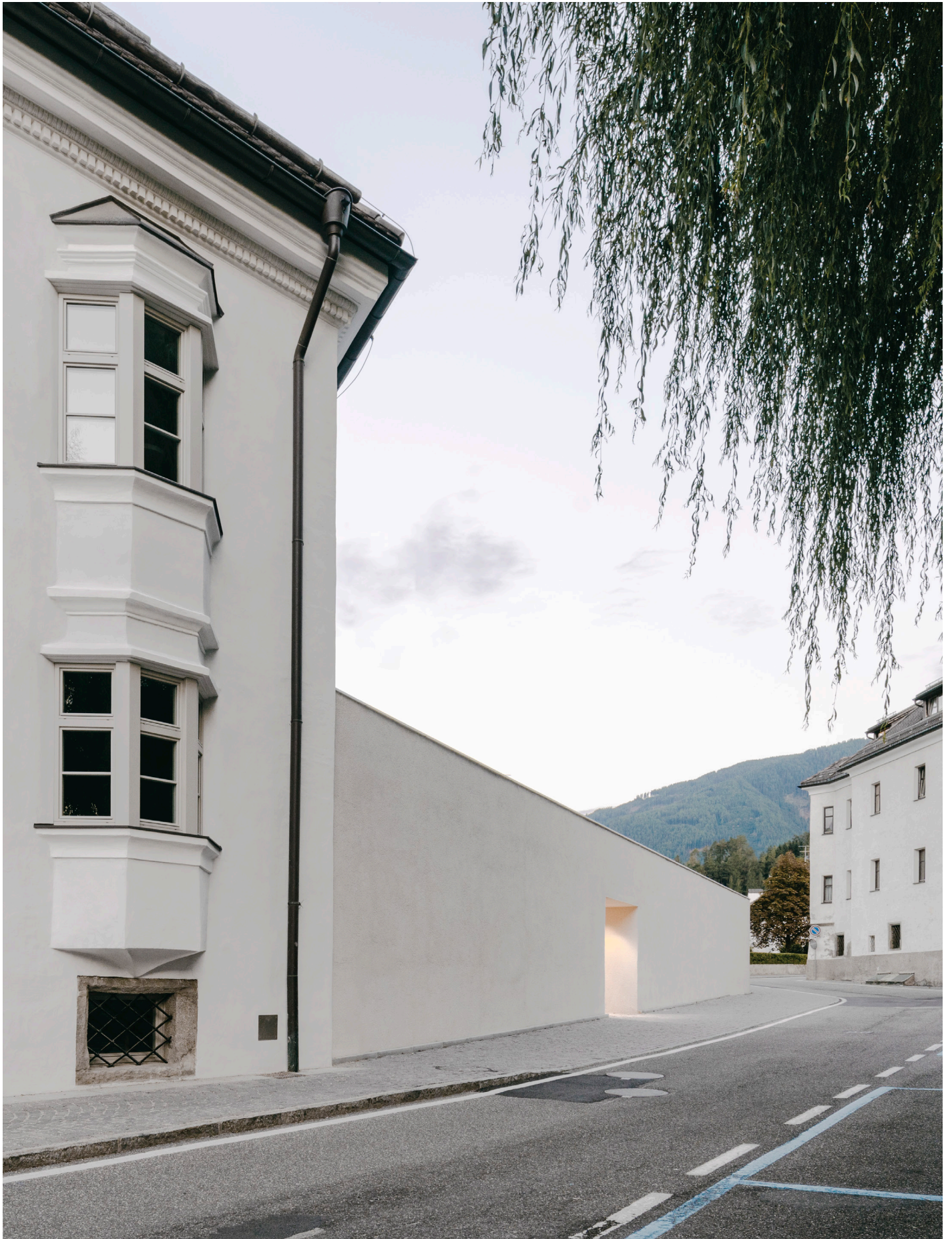
Raghenhaus Musikschule, Bruneck, Italy 2012–2018