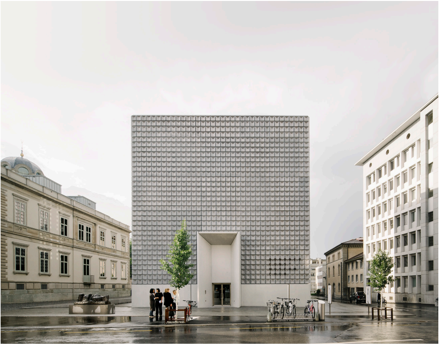
Bündner Kunstmuseum Chur, Switzerland 2012–2016