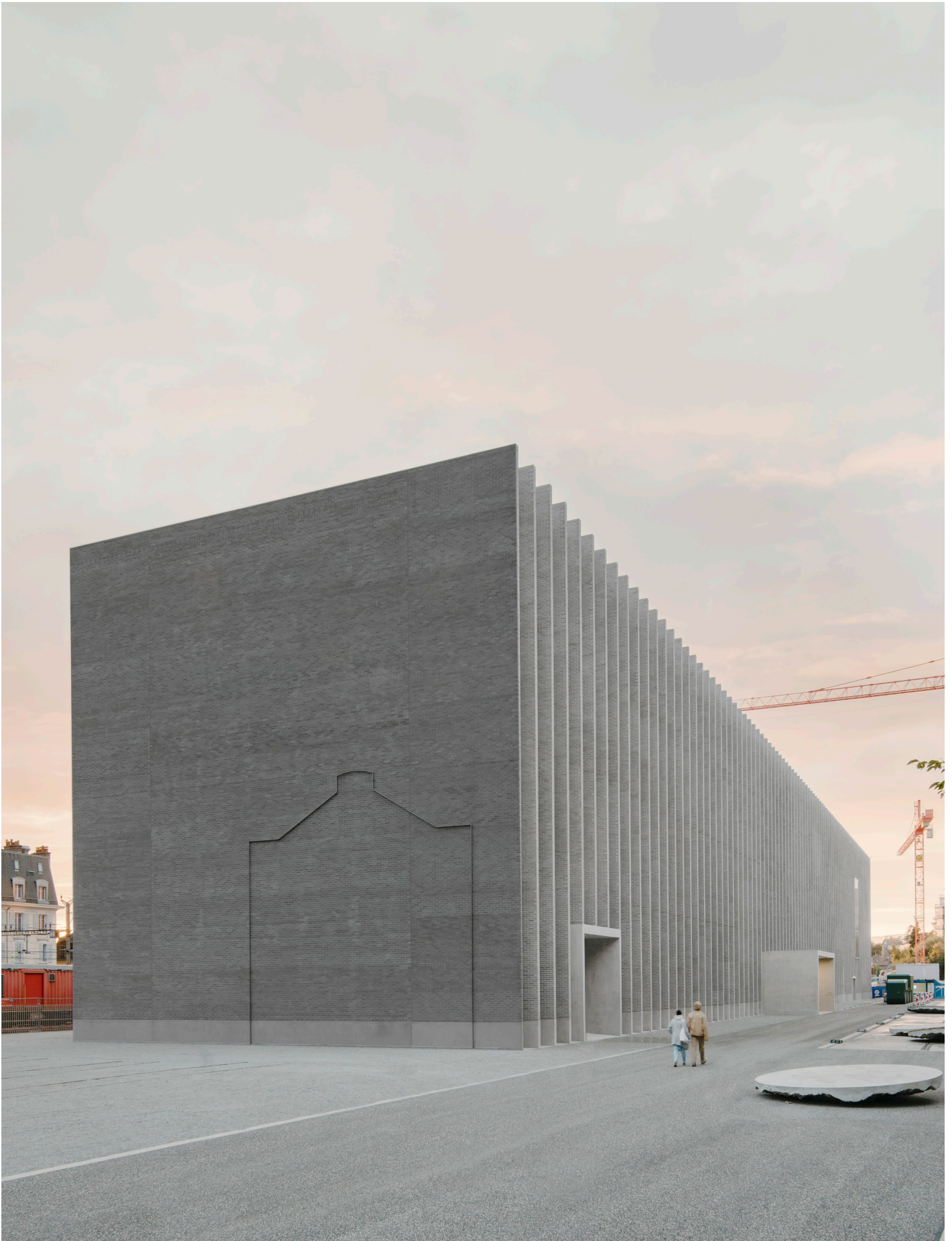
MUSÉE CANTONAL DES BEAUX-ARTS LAUSANNE, SWITZERLAND 2011-2019