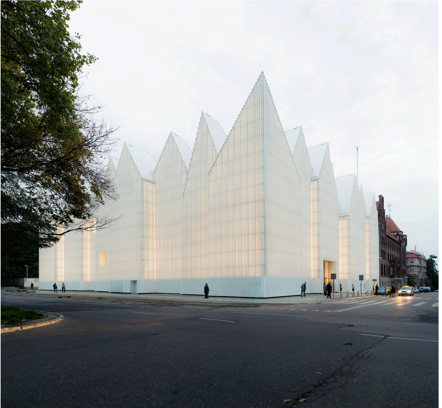
SZCZECIN PHILHARMONIC HALL, POLAND 2007-2014