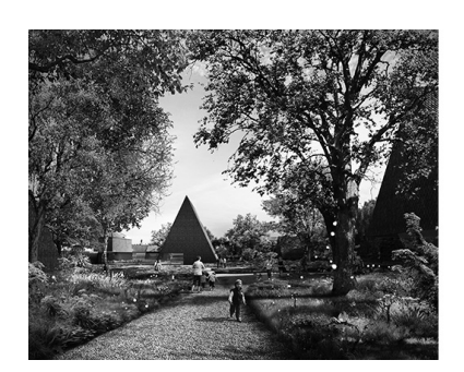
H. C. Andersen Museum Odense, Denmark 2015

Surrounded by a garden, the four proposed volumes sensibly arrange to form a microcosm: a place where architecture and landscape merge as one. The scale, proportion and views between the different elements allow for a changing perception, helping to reduce the sense of the city. The composition invites the visitor to guess the importance and differences between each of the elements. Each of the four forms has their own identity and a different function; yet not one of them can be understood without the other three, or without the garden. The four elements, simple and abstract, are surrounded by a garden that symbolizes the strength and complexity of the world of Andersen. They intend to awaken the imagination of the visitor, inviting a discovery of the unexpected.