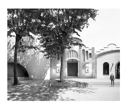
L'Artesà Theater El Prat de Llobregat, Spain 2015

The proposal isolates the building and allows to have gardens on both sides of the theater, enriching the relationship between the theater public spaces and its close environment. The reduced volume permits to have a better relation with the context, to minimize the underground construction and to reduce the costs. The side access through the existing façade and the axiality of the plan are faithful to the original project of the theater. However, the new proposal foyer is open to the gardens. The horseshoe-shaped hall preserves the intimacy and shortens the